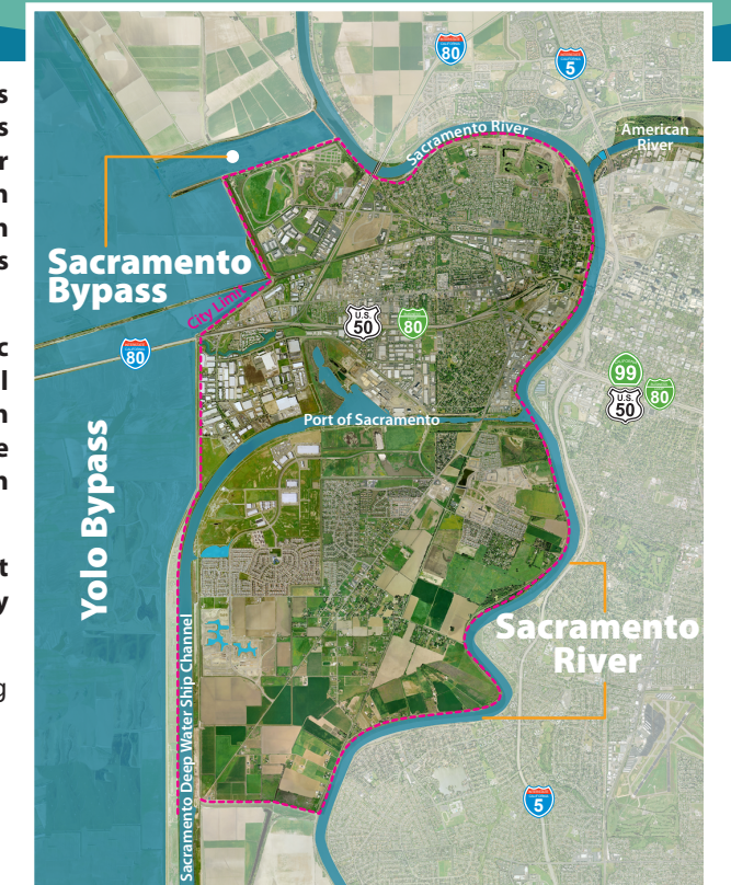
West Sacramento with Flood Waters in Yolo Bypass