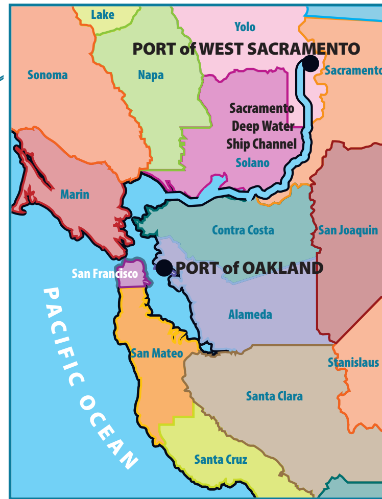
The Sacramento Deep Water Ship Channel: Provides the Sacramento Region with maritime access to the Pacific Ocean