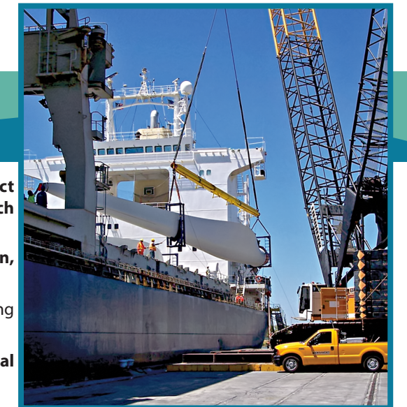
Port's Newest Green Cargo: Wind turbines off-loaded at the Port of West Sacramento are expanding wind energy production in the Central Valley.